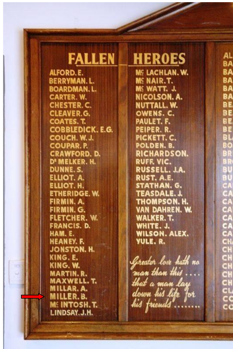
Traralgon Honour Roll