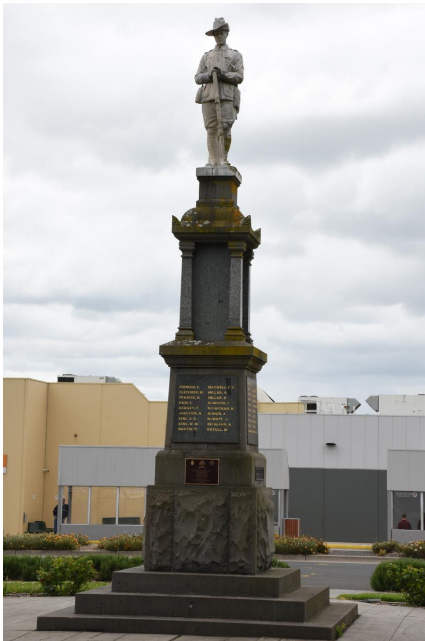
Traralgon War Memorial